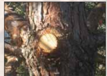
Correct pruning cut

#3 Many pines and weak trees had broken branches from the heavy snow and wind. In most cases, the branches can be pruned off and the trees will recover. It is best to make a professional pruning cut so the tree can easily "heal" the wound and minimize decay. The trees should be inspected to see if they will remain viable and safe after the damaged limbs are removed. Severely damaged trees may need to be removed if they are unsafe or unsightly.